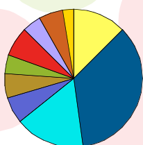
HUMAN HEALTH / MEDICINES